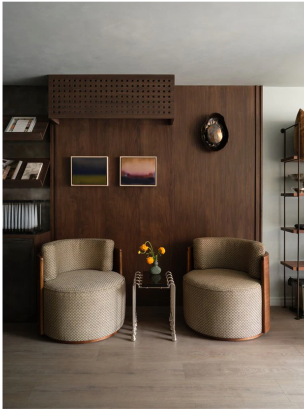
Manes Studio showroom.

From a bastion of brass hardware and gemstone-beaded chainmail lighting to a Cobble Hill interior design studio's venture into artisanal home goods